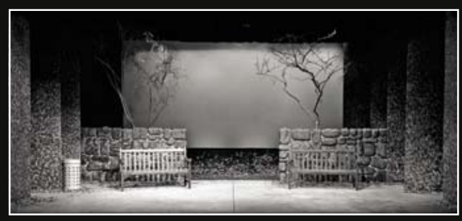
Set constructions by "Dad's Army" set builders